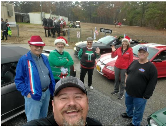
What a great picture!

More pictures from both events included in the links provided in Kathy's column.